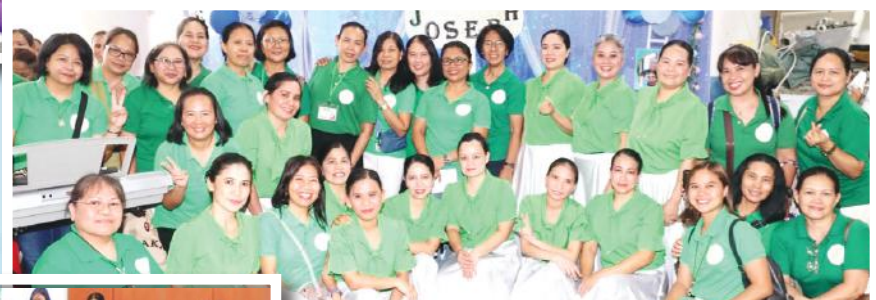
The Sowers Charismatic Community