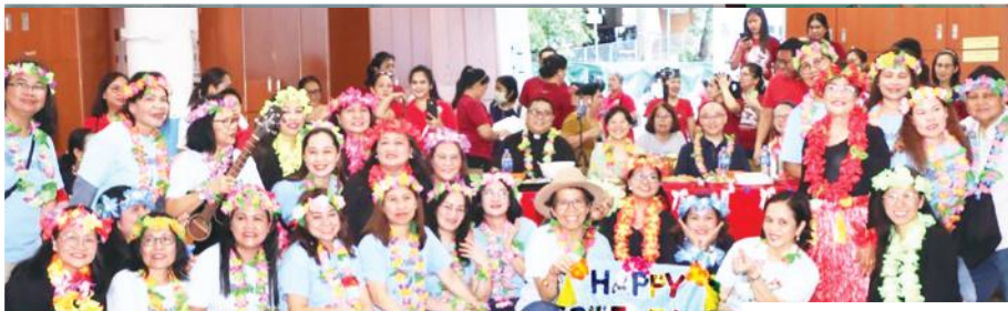
Filipino Catholic Group