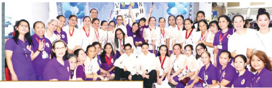
Apostleship of Prayer