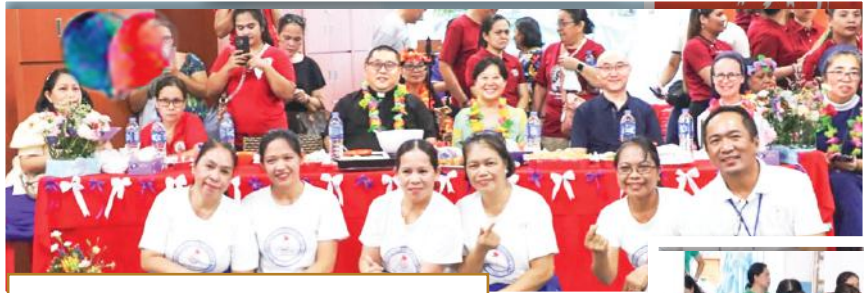
Filipino Prayer Group