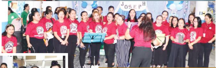
Black Nazarene Group