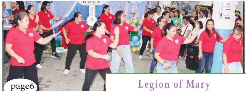
Legion of Mary