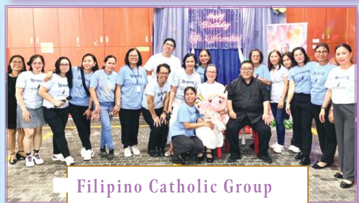
Filipino Catholic Group