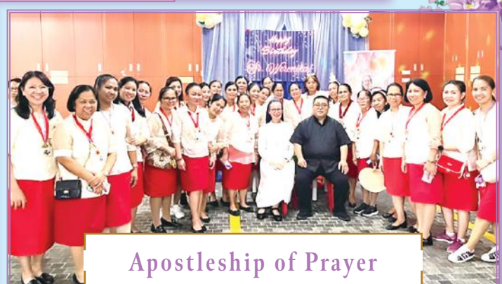
Apostleship of Prayer