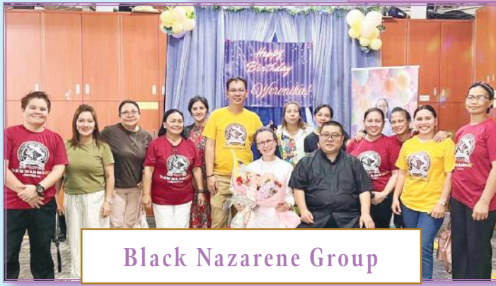
Black Nazarene Group