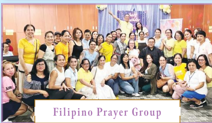
Filipino Prayer Group