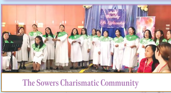
The Sowers Charismatic Community