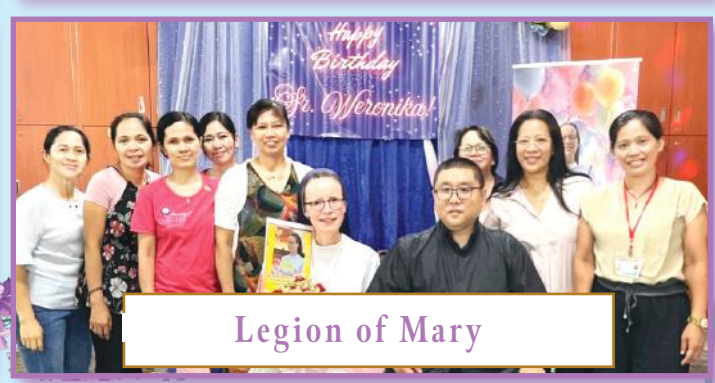
Legion of Mary